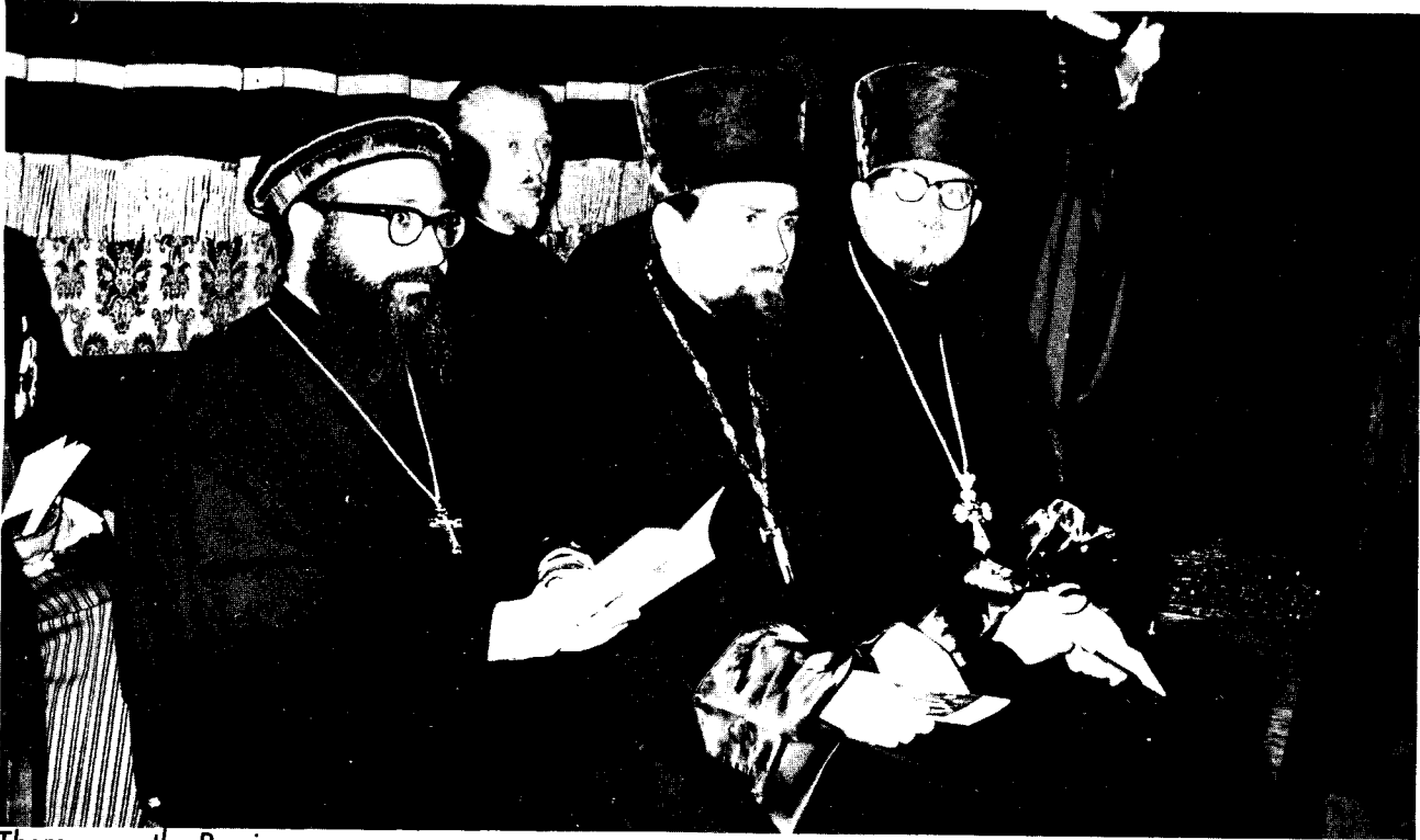
There were the Russians.

the True Cross of Our Lord. Inside the bronze chair, suspended beneath the ornamental window, is part of a chair actually once used by Saint Peter. In the crypt beneath Pope Paul is the body of Saint Peter, the first Pope, and also the bodies of the last two Popes: Pius XII and John XXIII.