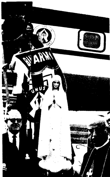
In 1967, golden jubilee of the apparitions, the Blue Army sponsored a chartered flight around the world with the Bishop of Fatima to present "Jubilee Statues" of Our Lady which had been blessed by Pope Paul. The Bishop of Fatima (right foreground above) spoke in each country of the message of Our Lady of Fatima in the world."

most blessed Virgin which have been recommended for centuries by the Magisterium of the Church'. (#67) And among them we judge well to recall especially the Marian Rosary and the religious use of the Scapular of Mount Carmel... a form of piety which is adapted by its simplicity to the spirit indeed of everyone, and is most largely widespread among the faithful for an increase of spiritual fruit. *