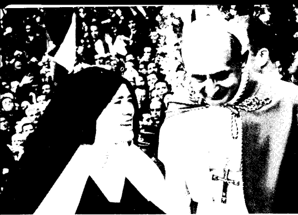
Above, Lucia (with whose help the Blue Army pledge was written) with Pope Paul VI at Fatima, May 13, 1967.

Fatima is of staggering importance. It is a supernatural intervention at a critical moment of history.