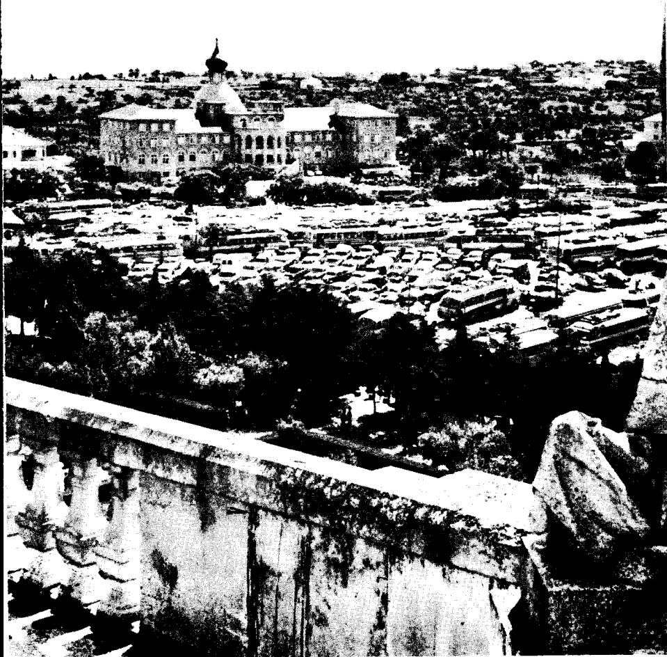
Above: International Centre of the Blue Army of Our Lady of Fatima taken from the Basilica.