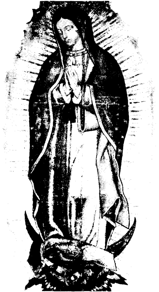
In 1531 Our Lady appeared in the principal city of America clothed in white, blue and brown and praying in the sun. In the same colors she appeared in the sun at Fatima: "So that everyone may believe".