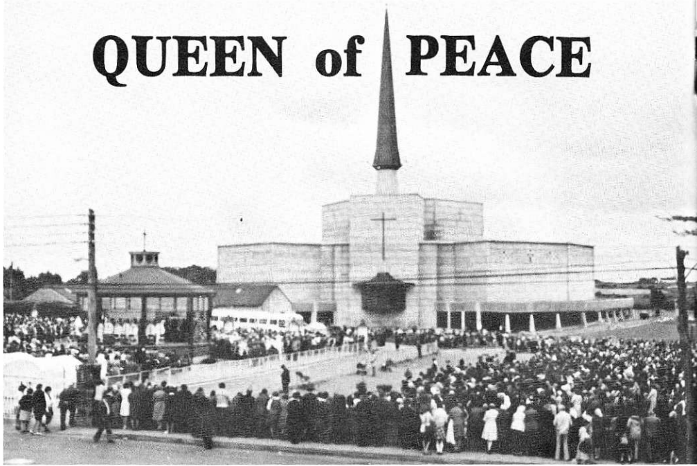
Above: Partial view of the crowds at the Peace Pilgrimage at Knock, Ireland, last June 20th. New Basilica of the Queen of Ireland, just dedicated as this issue of SOUL went to press, is in background. It will accommodate about 10,000. In the left foreground is the original parish church where the apparition took place on August 21, 1879.