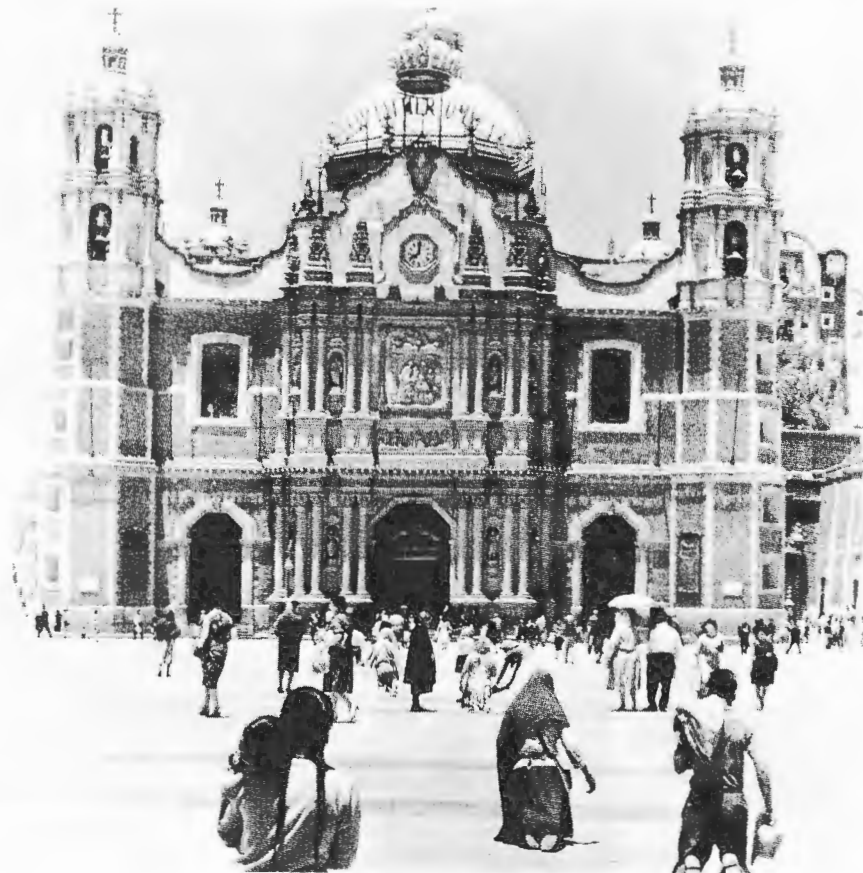
Pilgrims on their knees at the Shrine of Our Lady of Guadalupe, Mexico.

When we make a pilgrimage from America we will most likely take a prolonged trip because it costs so much to cross the Ocean. To the average person it is a “once in a lifetime” experience and therefore should include as much as possible. Consequently this trip which may last a month creates a