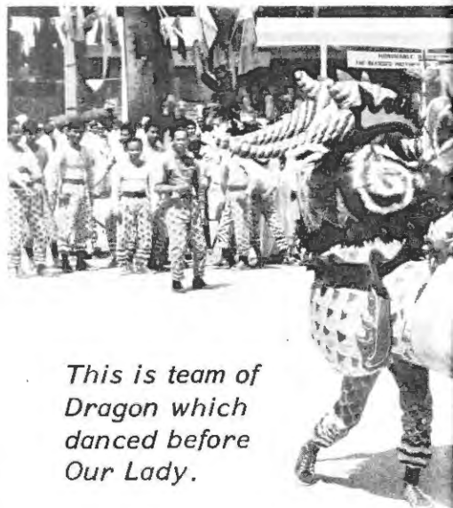
This is team of Dragon which danced before Our Lady.