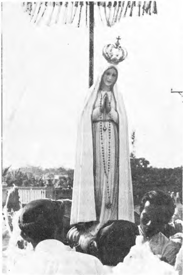
Not only was an immense Rose-Parade-like float prepared to take the statue from helicopter (above) to the main temple (top right), but in the center of the plaza of the Holy See (bottom right) a high structure was erected, with invocations to Our Lady of Fatima inscribed about the top, under which the great float was driven for all to see...and to venerate Our Lady. It is shown below.